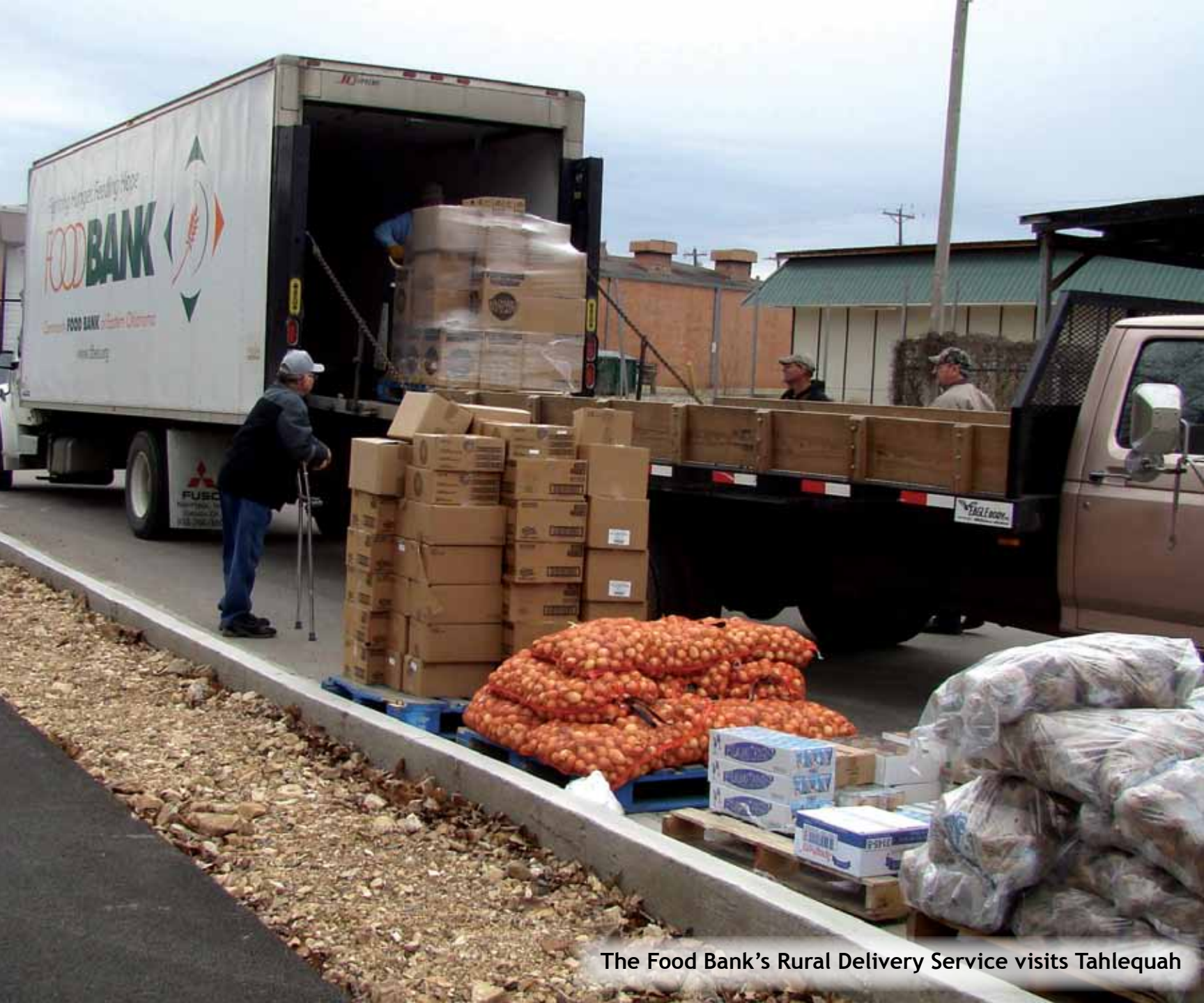
The Food Bank's Rural Delivery Service visits Tahlequah