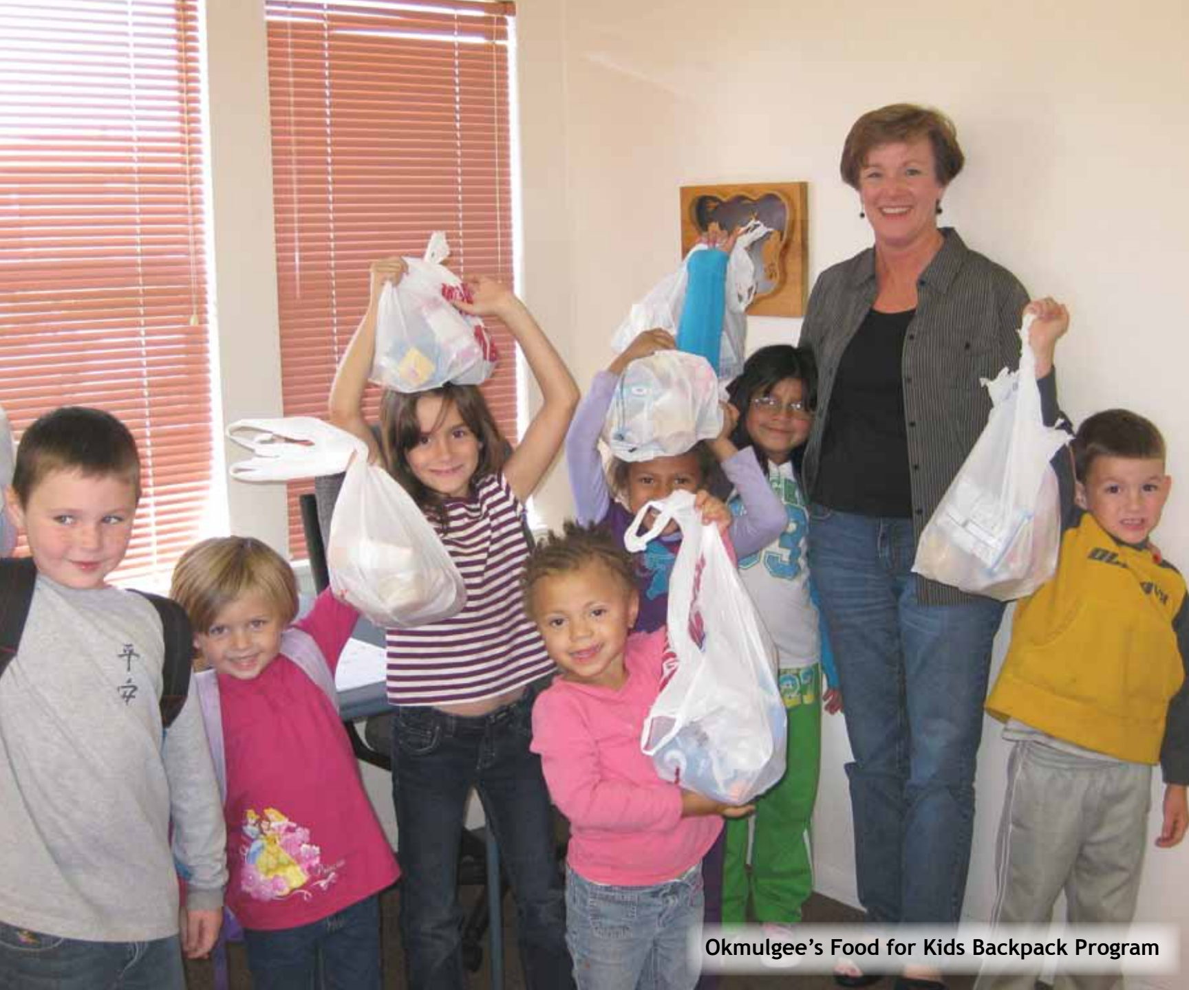
Okmulgee's Food for Kids Backpack Program